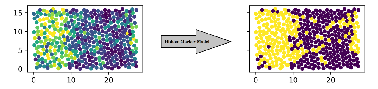
Figure SI 1: Top-down simulation snapshot from a flip-fixed Cooke simulation with \delta n = 7\% showing the positions of lipids in the compressed monolayer. On the left, lipids are given color shading based on the value of their hexatic order parameter |\psi_6| , with dark blue being high and light green/yellow being low order. The right shows the same snapshot now colored based on HMM labeling as one of two discrete states. The dark purple coloring corresponds to the highly ordered phase (gel). Axes are in CG length units \sigma^* .

Samuel Foley, Amirali Hossein, and Markus Deserno